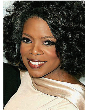
Oprah Winfrey , television host/producer, first African-American female billionaire

The 2010 Black History Theme: “The History of Black Economic Empowerment” Celebrating the Centennial Anniversary of the National Urban League Tuesday, February 16, 2010 5:30 p.m.