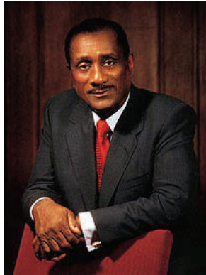
John Johnson , publisher, founder of Ebony and Jet magazines