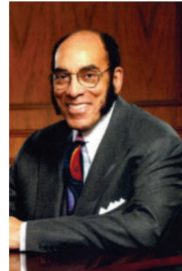
Earl Graves , publisher, founder of Black Enterprise magazine