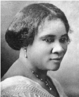
Madam C.J. Walker , hair care entrepreneur, the first female millionaire by her own achievements